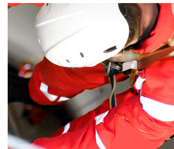
SEARCH & RESCUE