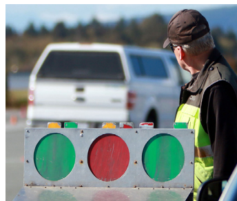
DRIVER EDUCATION & ROAD SAFETY