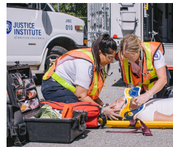
PARAMEDICINE & HEALTH SCIENCES