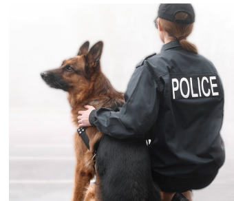
LAW ENFORCEMENT & INVESTIGATION