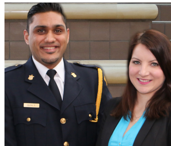
CORRECTIONS & YOUTH JUSTICE