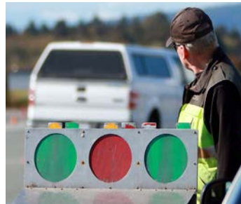
DRIVER EDUCATION & ROAD SAFETY