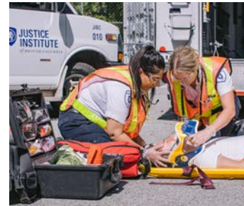
PARAMEDICINE & HEALTH SCIENCES