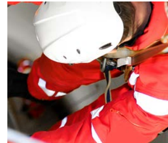
SEARCH & RESCUE