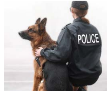
LAW ENFORCEMENT & INVESTIGATION